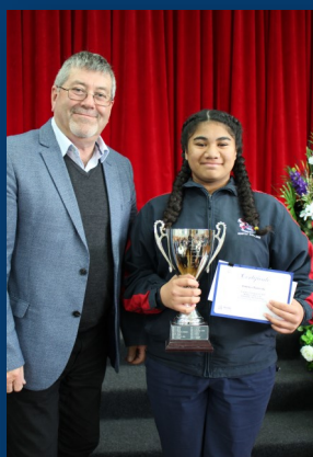
Top ‘Year 9’ Journey Penerata