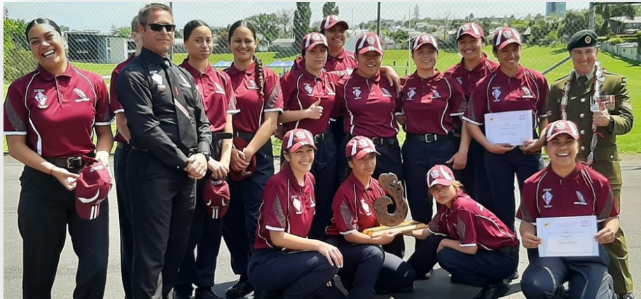
Northern Region Services Academy graduation parade held in Auckland over the weekend, Saturday 2 November.